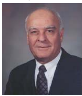
More about Nonlinear Dynamics More about the ASME Award