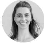
Kira Schilling lifestyle-astronaut