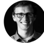
Herbert Mangesius Vito Ventures