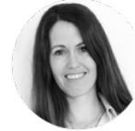
Noaa Barak Mobile World Capital